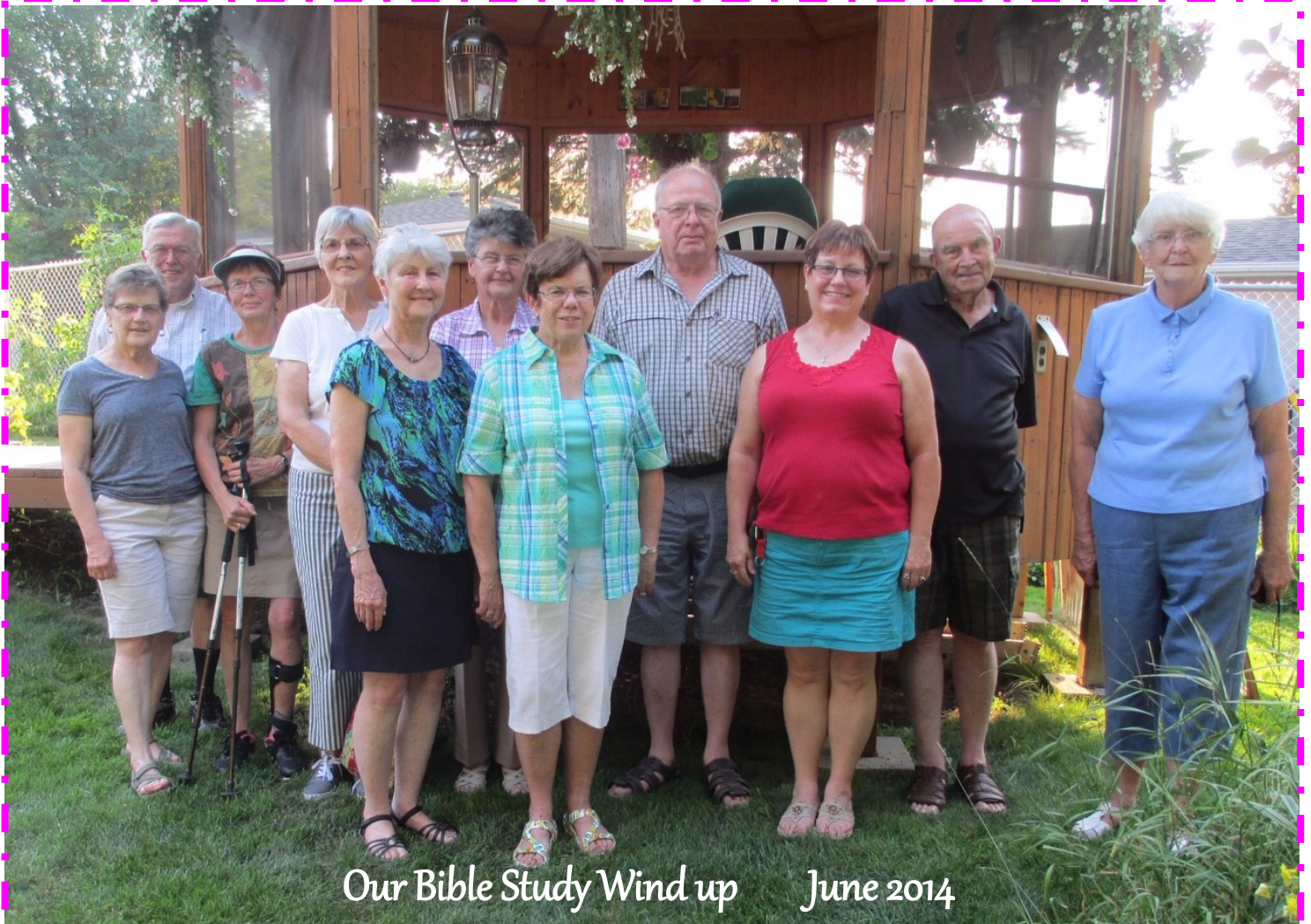
Our Bible Study Wind up June 2014