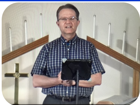
May 16th 7th & last Sunday of Easter All the Way My Saviour Leads Me