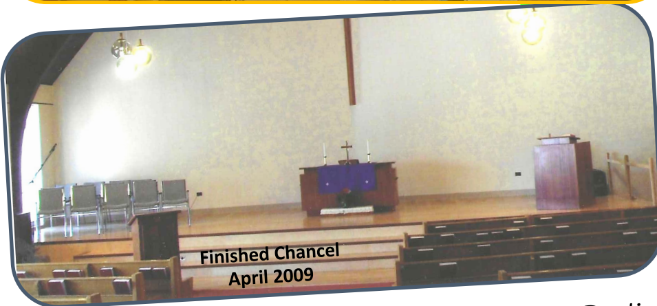
Finished Chancel April 2009