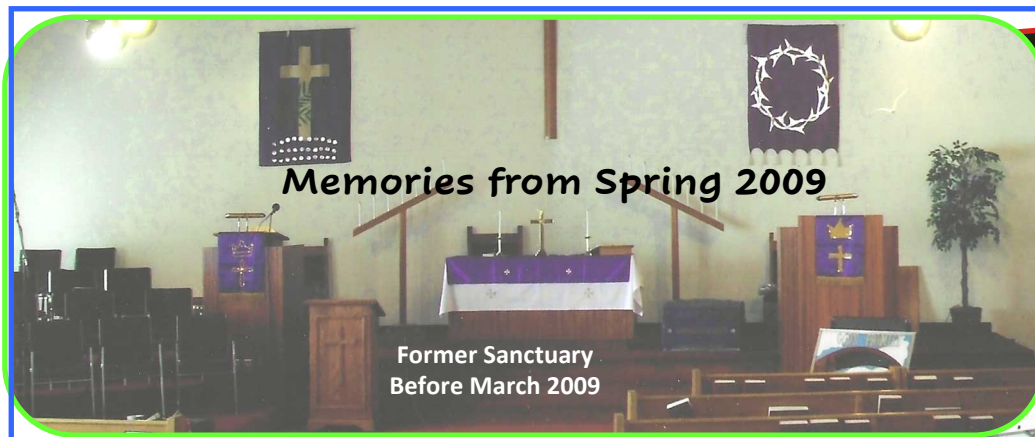
Memories from Spring 2009